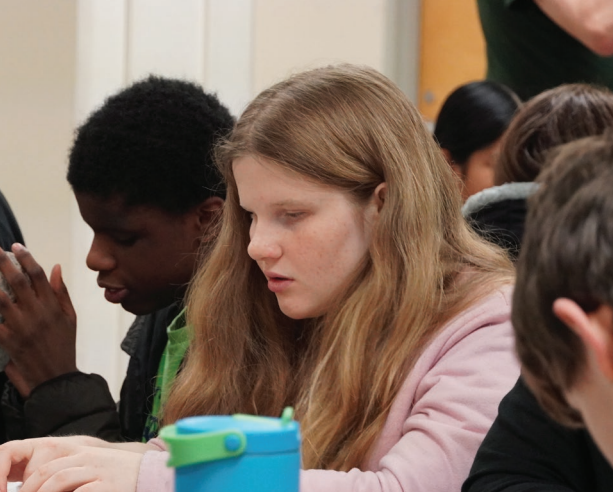
Caption: Braille Challenge students sit at a table listening to the presenter.