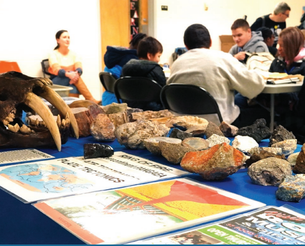
Caption: Various rocks and fossils are displayed on a table alongside geological graphs and charts.